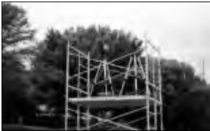
Figure 2. Video cameras are placed on scaffolding.

reviewed, and the information on the type, severity and numbers of conflicts were gathered together with the volumes. The types of conflicts that were considered in this study included right-turn out conflicts, slow-vehicle same-direction conflicts, lane-change conflicts, U-turn conflicts, slow U-turn vehicle same-direction conflicts, left-turn out of driveway conflict from right, direct-left turn and left-turn in from-right conflicts, direct-left turn and left-turn in from-left conflicts, and left-turn out of driveway conflict from left. The two directional traffic volumes on the major streets varied from about 2,600 to 6,700 vehicles/hour (veh/hr) with an approximate average of 4,500 veh/hr.